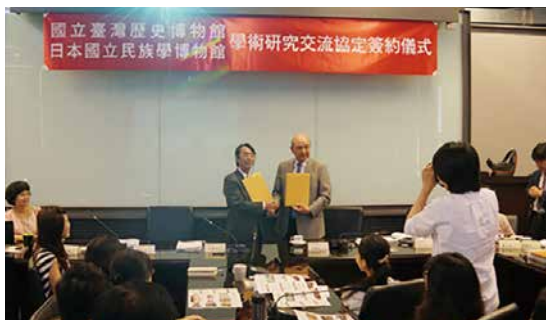
Signing Ceremony with the National Museum of Taiwan History (Taiwan)

To promote research collaboration and strengthen cooperation consideration and signing of scholarly cooperation agreements with overseas research institutions is proceeding. Based on these agreements, international symposia and workshops were conducted during FY2015, Minpaku signed cooperative agreements with the National Museum of Taiwan History (Taiwan) in October, Vanderbilt University (USA) in January.