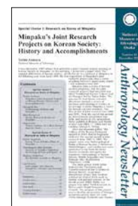
MINPAKU Anthropology Newsletter

This is a network of international researchers who have worked with or for the Museum in the past, and foreign and domestic research institutions with close ties to the Museum. In order to promote awareness and improve information exchange, our English Newsletter ( MINPAKU Anthropology Newsletter ) is published bi-annually. There are approximately 1,200 members in the Minpaku Fellows program.