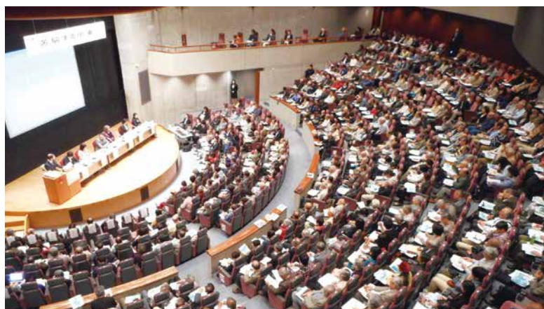
The 26th NIHU Symposium "The Middle East in Distress"