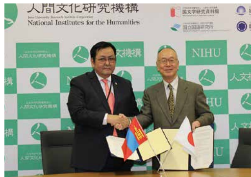
International Collaboration with Mongolian Academy of Sciences

Under an agreement with the Arts and Humanities Research Council (AHRC) of the United Kingdom, NIHU accepts graduate students and young researchers and give research guidance to them, for example, thereby contributing to the development of overseas researchers on Japan.