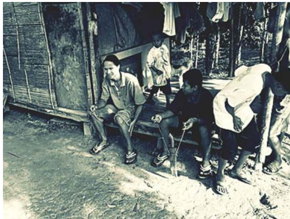
Orang Asli in Kampung Rembai, Selangor

"They don't have the right motivation nor the competence needed to fulfil their responsibility towards the Orang Asli," he explained.