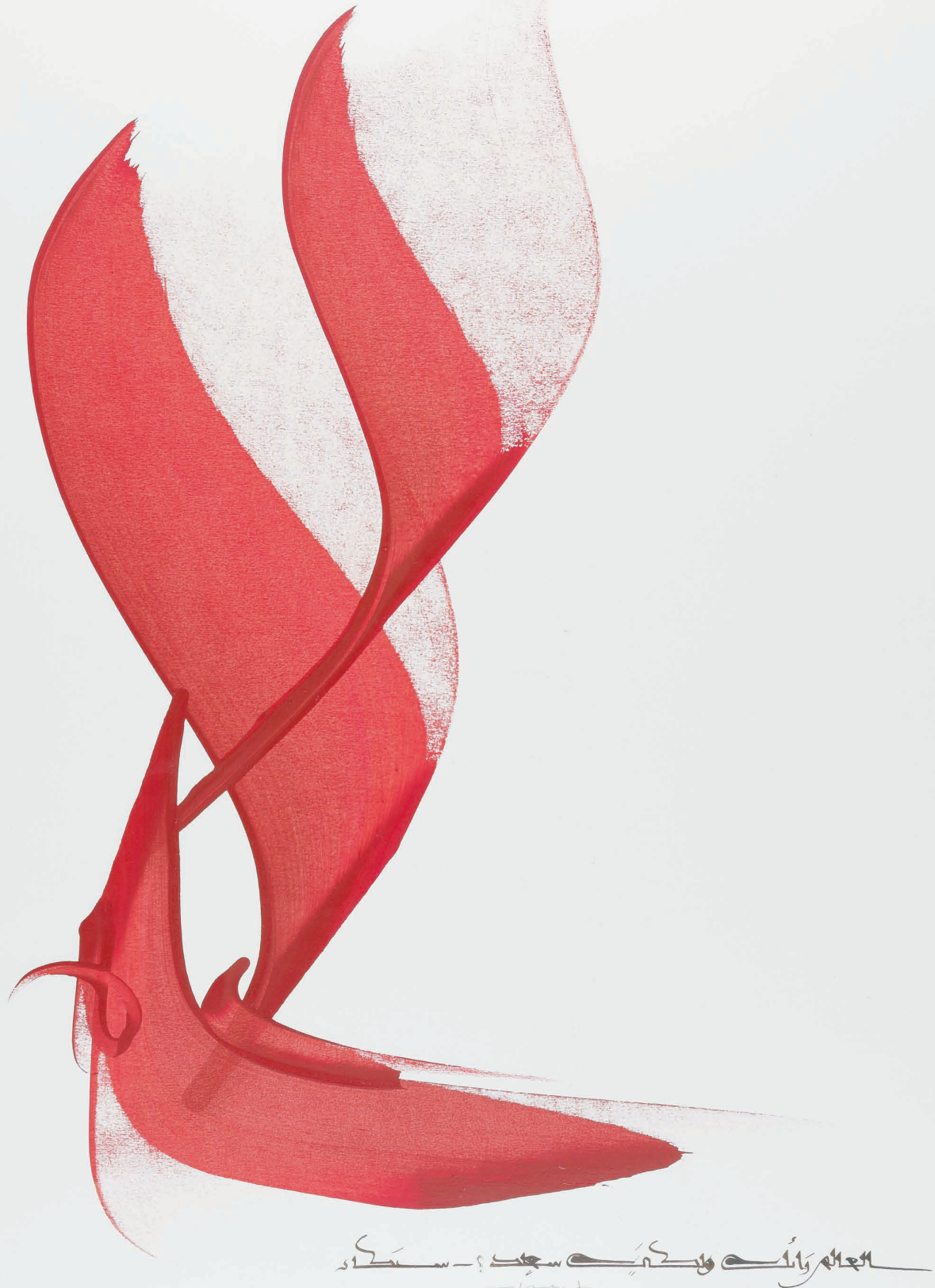
Arabic calligraphy by Hassan Massoudy (2005) "Le monde est éphémère mais je suis joyeux." Sengai, National Museum of Ethnology Collection

The Event of the 100th Anniversary of Arabic Public Education in Japan, under the Patronage of UNESCO: Exploring Intercultural Dialogue of Japan and the Arab World through the Arabic Language