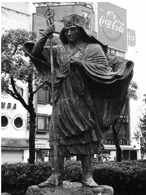
Statue of Banryū near Matsumoto station.

Banryū’s example stands in stark contrast to that of Walter Weston, a