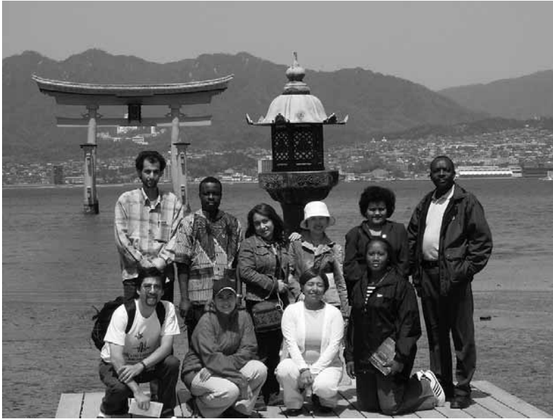
Participants on a study trip to Hiroshima (Itsukushima-shrine, 2005)

weeks), and has a number of communication requirements.