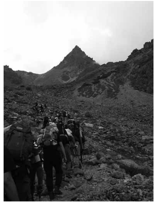
Participants in commemorative Banryū pilgrimage to the summit of Yarigatake, September, 2005.