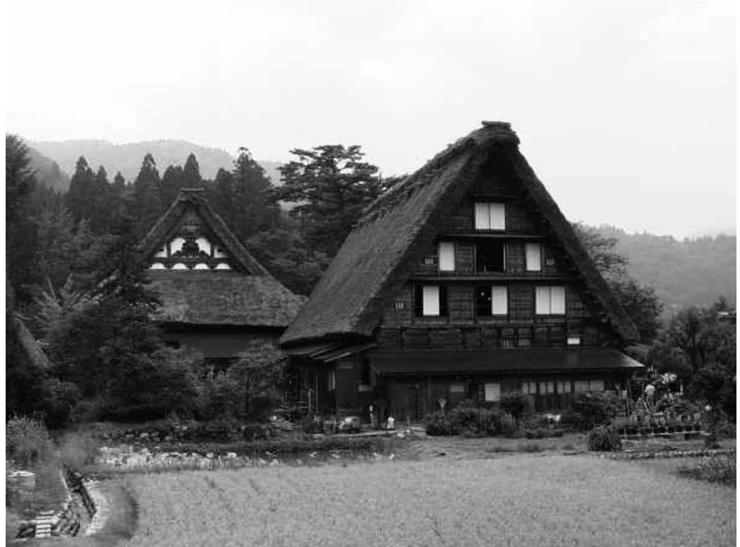
The thatched roofs of Myozenji temple and rectory in early autumn