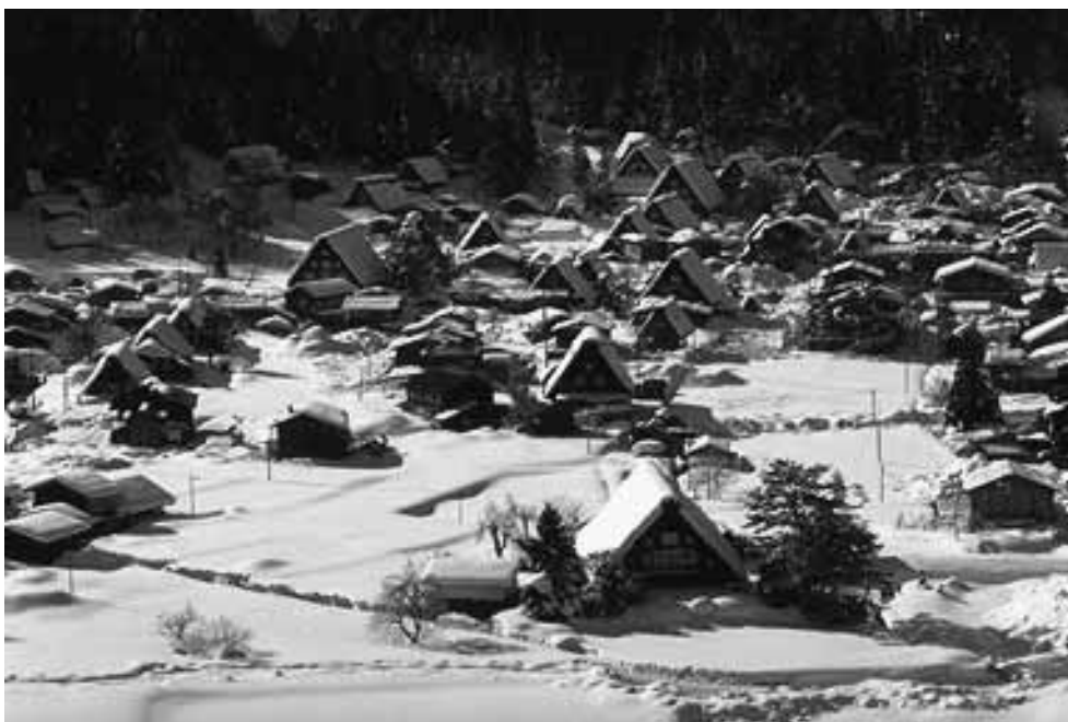
The Gassho roofs of Ogimachi blanketed in snow

preservation society, known as the Mamoru Kai, the mandate of which is to maintain the traditional appearance of the village. Last year, he went on a fact finding mission to Greece and England to study preservation techniques and policies, and was impressed by their conservation techniques, policies, values, and philosophies, especially the commercialisation of the National Trust in England. He suggested that we go for tea, and then for a drive up a local scenic road, where he had a small job to do. On the way we talked about problems with the restrictions imposed by heritage conservation