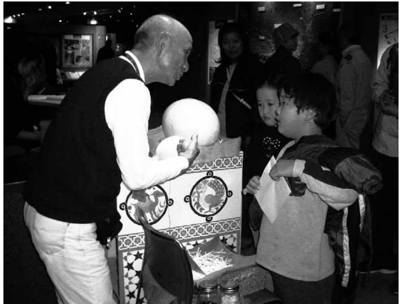
MMP member introducing 'Aepyornis' Egg' to children

In reality, many volunteers had already started activities within the new framework because we were holding a special exhibition 'The Arabian Nights' from early September. The performance of every volunteer was outstanding, given the limited time for preparations. They helped visitors enjoy wearing Arabian costumes in the exhibition everyday, and created some new programmes by themselves: coloring of the Arabian Nights tales, a picture-story