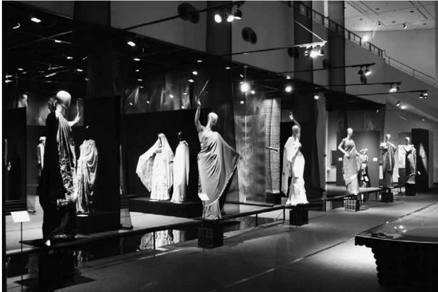
Main arena, special exhibition hall