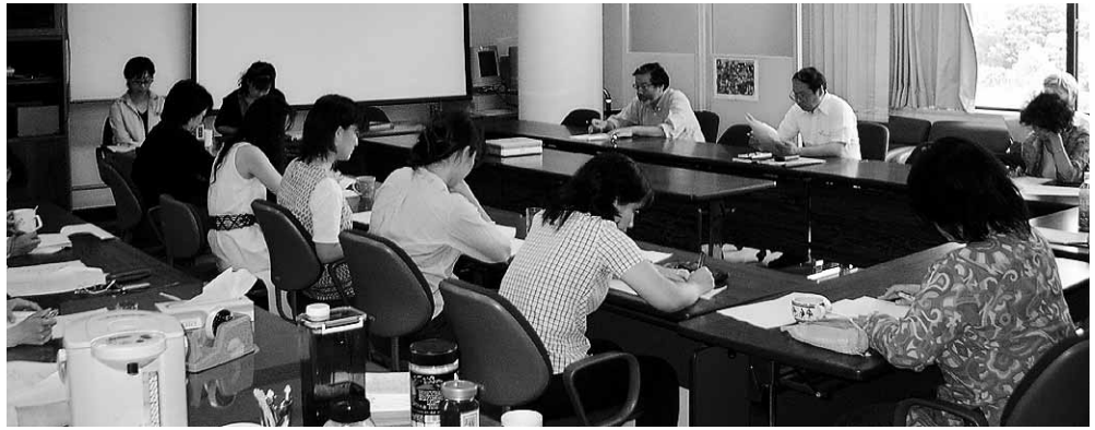
New students introducing their dissertation topics

The Sokendai departments at Minpaku have also initiated two more projects to promote educational and research coordination among member departments and institutes of Sokendai: 1) encouraging students to attend lectures and symposia presented by other departments in the School of Cultural and Social Studies, and 2) a